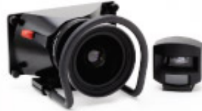
[21392] SW617 90 Lens Unit (Schneider)

Lens Construction : 4groups 8elements Image circle : 226mm \phi Vertical Shift : 17mm Rise/Fall each Closest Focusing Distance : 0.8m Filter Diameter : 95mm \phi Weight : 1,240g