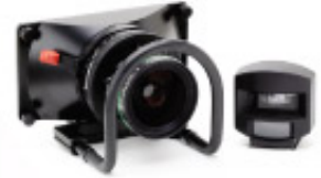
[21393] SW617 90 Lens Unit (Rodenstock)

Lens Construction : 4groups 8elements Image circle : 259mm \phi Vertical Shift : 17mm Rise/Fall each Closest Focusing Distance : 1.1m Filter Diameter : 95mm \phi Weight : 1,370g