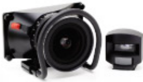
[21391] SW617 72 Lens Unit